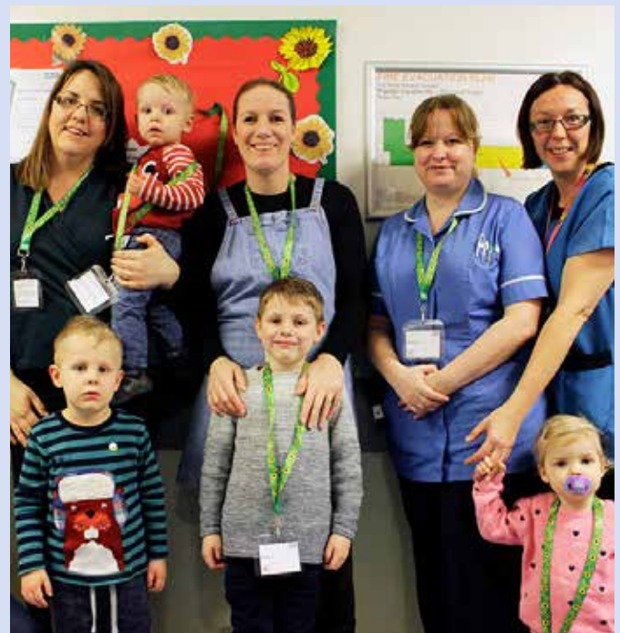
Staff, parents and patients at Great Western Hospital Children's Unit which introduced the lanyard scheme earlier this year

Following an update about the success of the GWH scheme at a recent BSW Clinical Board meeting, clinical leaders are now actively looking at how it could be rolled out across other health and care settings in BaNES, Swindon and Wiltshire.